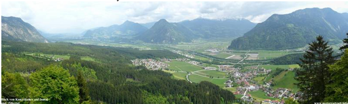
Blick vom Kanzleiberg auf Inntal und Zillertal

Then we continued via Reutte and Garmisch-Partenkirchen to Wallgau and from there on the toll road to Vorderriß and the Sylvensteinsee.